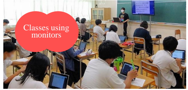
*The above initiative is premised upon approval of the FY2023 budget.